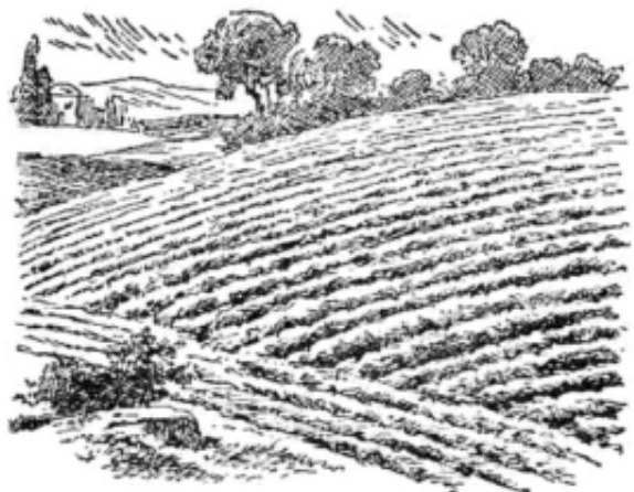
One man wouldn't come. Where did he go?