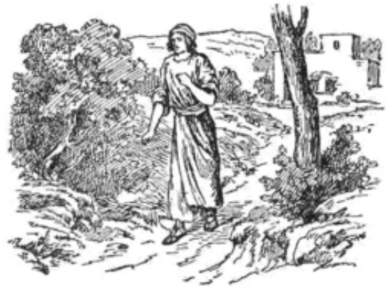
Who delivered the invitations?