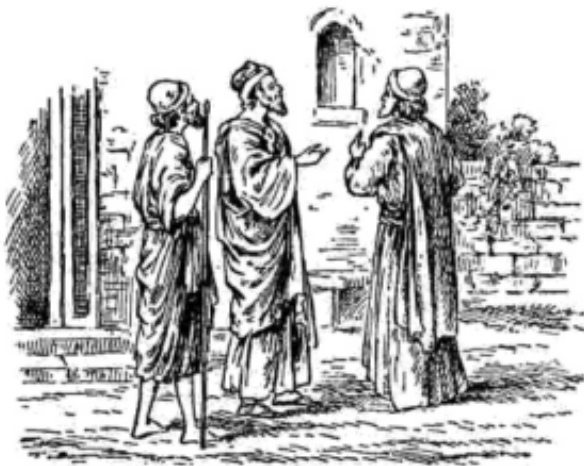
What did the guests say to the servants?