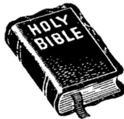
The Word of God