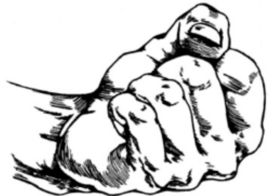
The Enemy (Taking Away the Word)