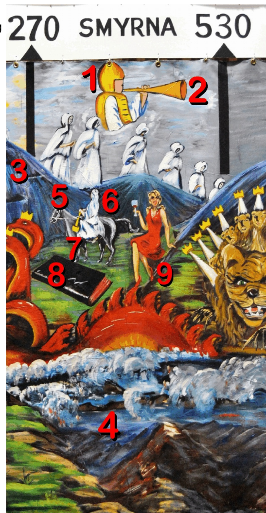
Reference Text: Revelation 2:8-11